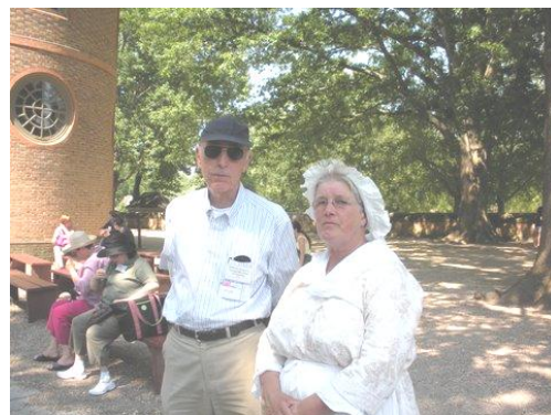
A docent at Colonial Williamsburg