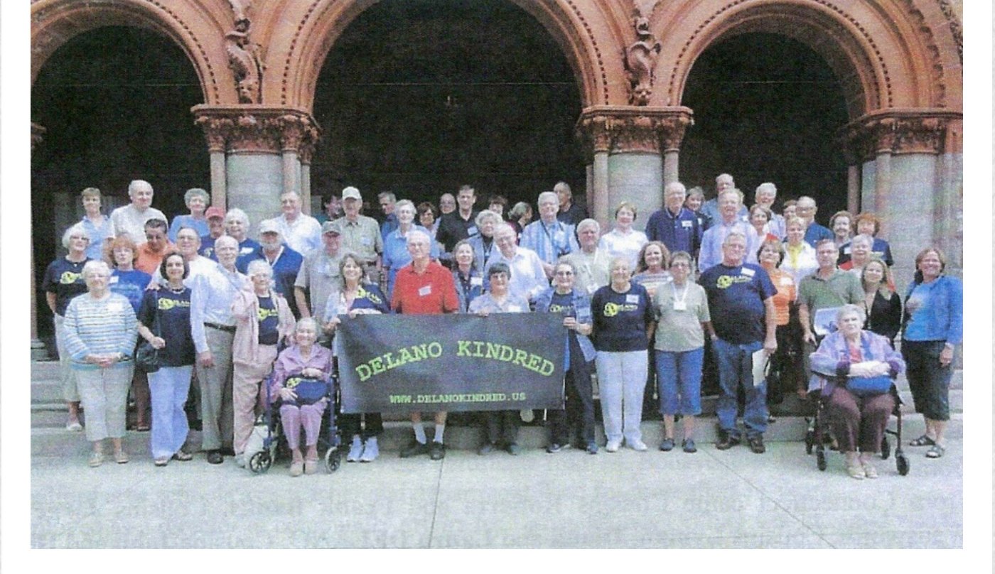
Group photo from the 2012 Annual Meeting in Fairhaven, MA