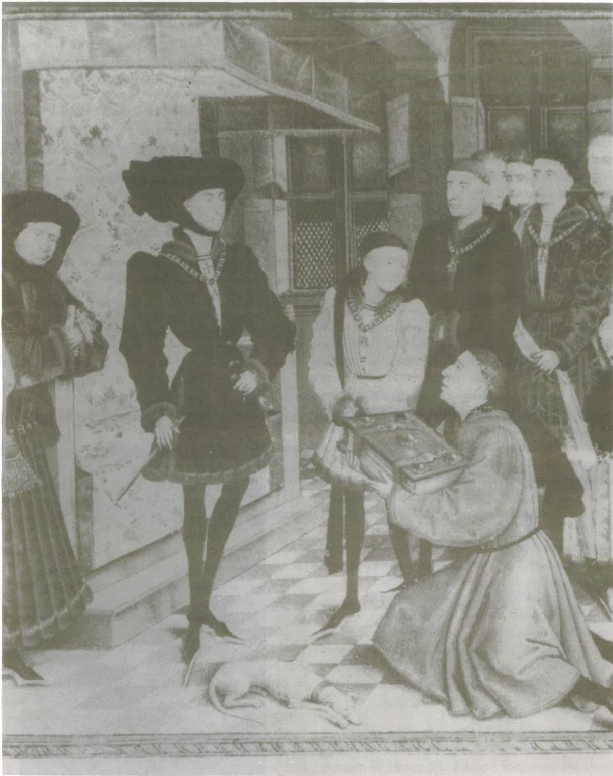
Duke Philip the Good receives the " Chroniques de Hainault "