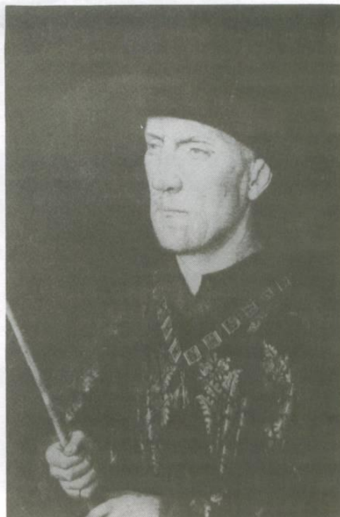
Van Eyck's portrait of Boudoin de Lannoy