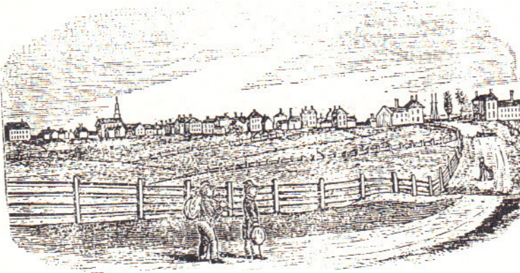
Duxbury circa 1840