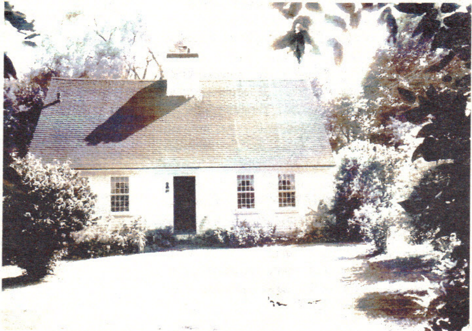
Dr. Thomas Delano House circa 1667

will take place because of insufficient lead time to make all the arrangements necessary for this event. Therefore, this event has been removed