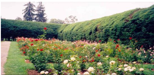
Sara D. Roosevelt's Rose Garden