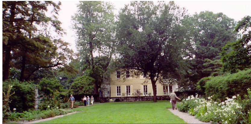
Bellefield and the garden