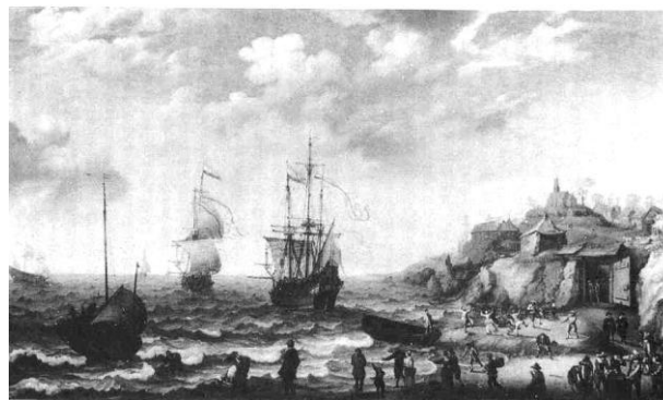
Here identified as a View of New Plymouth, Adam Willaerts, 1638.