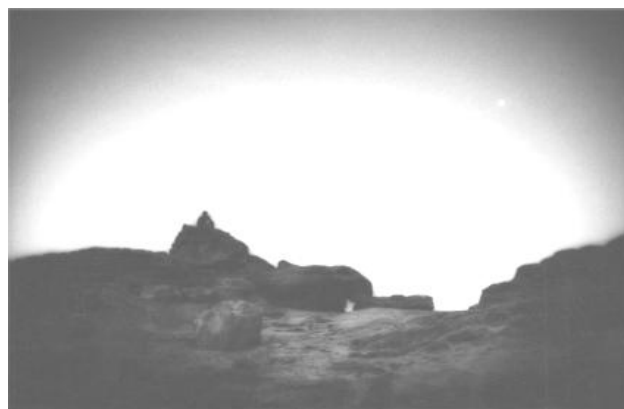
AI CONFINI DEL MONDO