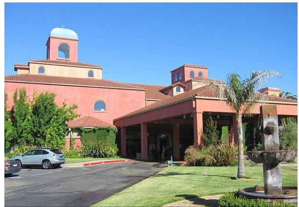
Doubletree Hotel Sonoma Wine Country at Rohnert Park