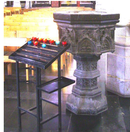
Baptismal Font in the Church of St. Christophe at Tourcoing

Thus Jean de Lanoy, son of Guilbert de Lanoy, was baptized on May 9, 1575, in the Roman Catholic parish church of St. Christophe at Tourcoing. Either his parents were still Roman Catholic or their Protestant views were kept secret. Calvinists did not reject their own baptisms that had occurred before they became Protestant. This attitude (against anabaptism) might have provided justification in dangerous circumstances for going along with having a child baptized according to Catholic ritual even when not agreeing with all aspects of it on theological grounds (such as the non-biblical rites of using salt and anointing with oil, of having the godparents swear, as stand-ins for the infant, the child's rejection of the devil, etc.) So it is impossible to conclude that the family was still Catholic in 1575 even though their child was baptized in a Catholic ceremony.