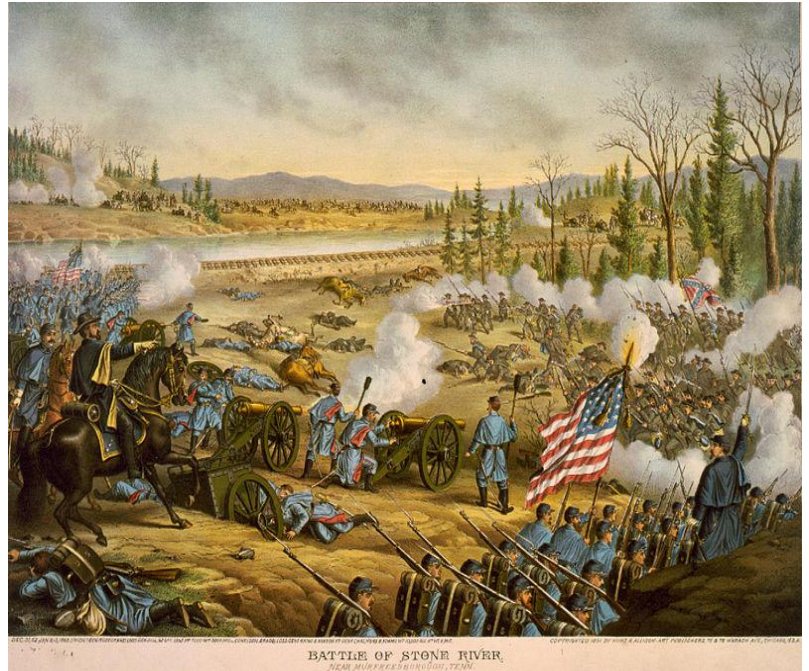
BATTLE OF STONE RIVER

Union Maj. Gen. William S. Rosecrans's Army of the Cumberland marched from Nashville, Tennessee, on December 26, 1862, to challenge General Braxton Bragg's Army of Tennessee at Murfreesboro. On December 31, each army commander planned to attack his opponent's right flank, but Bragg struck first. A massive assault by the corps of Maj. Gen. William J. Hardee, followed by that of Leonidas Polk, overran the wing commanded by Maj. Gen. Alexander M. McCook. A stout defense by the division of