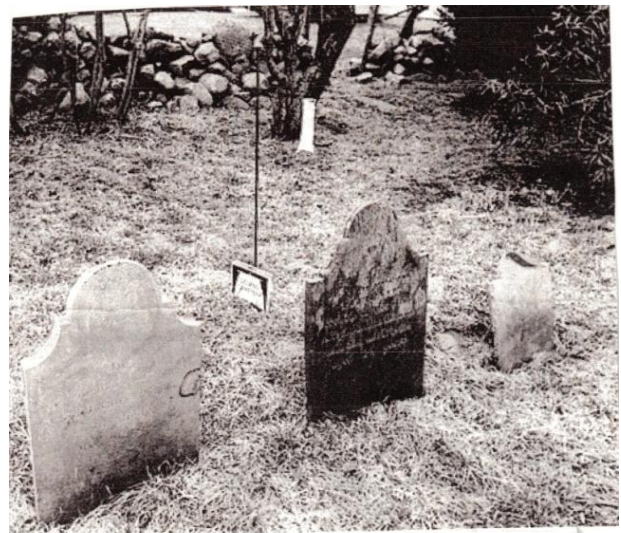
Delano Cemetery 1986: Sconticut Neck: Fairhaven