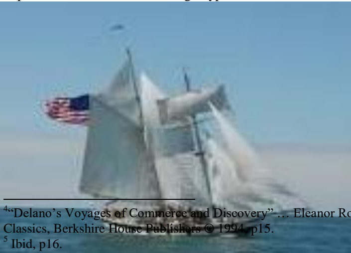
The Brig GRACE