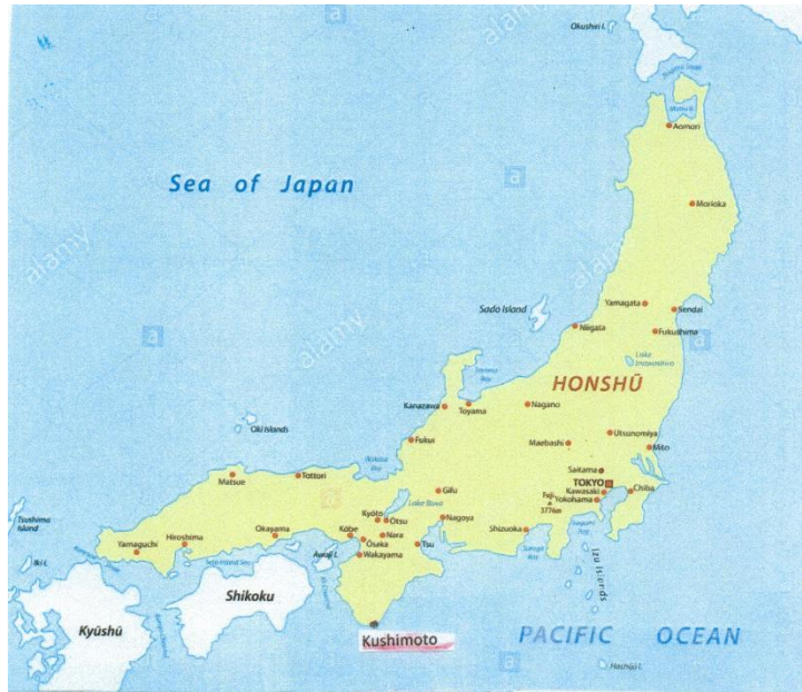
Honshu Island, Japan showing Kushimoto underlined in Red

with the Lady Washington , commanded by Captain Kendrick, for Northwest America by way of Japan. They planned to stop in Japan to open trade with Japan 6 . Samuel's duty aboard the Grace was ship's clerk so he kept the log of the voyage. "As the ships approached, they were caught in a storm and swept toward the Kii Peninsula by the Kuroshio Current. Seeking shelter, they entered the channel between Kozo on the mainland and the island Kii Oshima. Then they moved into the protected bay behind the island, near the village of Kushimoto. The village head man sent a message to the daimyo at Wakayama Castle as did the head man of near-by Koza village. After the storm had passed a few villagers approached the ships, despite the law forbidding contact with foreigners. Kendrick invited them aboard the Washington , and a few did. Some of the Chinese crewmen were able to communicate via written notes. They said they had been driven to port by the storm and would not stay more than three to five days, but they also carried trade goods, especially sea otter furs. Kendrick and Douglas soon discovered that the Japanese had no interest in